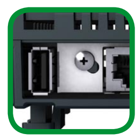
USB - Ethernet port

With the arrival of an embedded Ethernet connection, communication is now more open and faster with the Magelis STU. In addition, multiprotocol RS485/232 standard RJ45 ports, as well as USB ports (mini and standard versions), make it easier to communicate with commercially-available equipment, without extra cost.